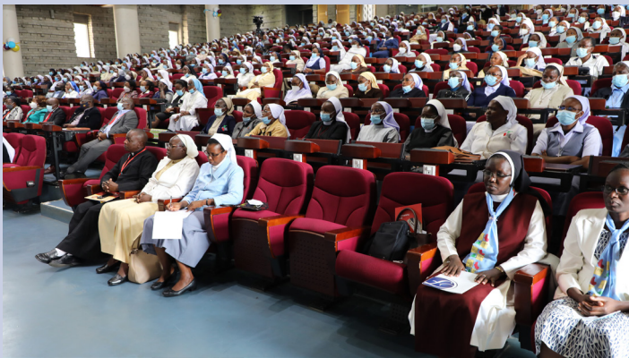
Participants following a presentation during the Visit from the Conrad Hilton foundation

ed by more than Sixty ASEC students amongst them the alumnae of this program and the current students benefiting from this ASEC program. The event was graced by the Archbishop of the Nairobi diocese Philip Anyolo. During the same day, The data Center for the African Sisters was officially launched and the Centre has now got its offices at the Catholic University of Eastern Africa.