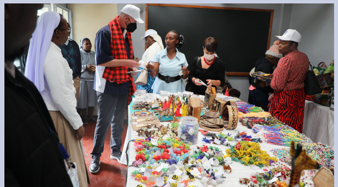
The Conrad Hilton foundation Team during their visit at Daughters of help of training centre in Dagoretti.