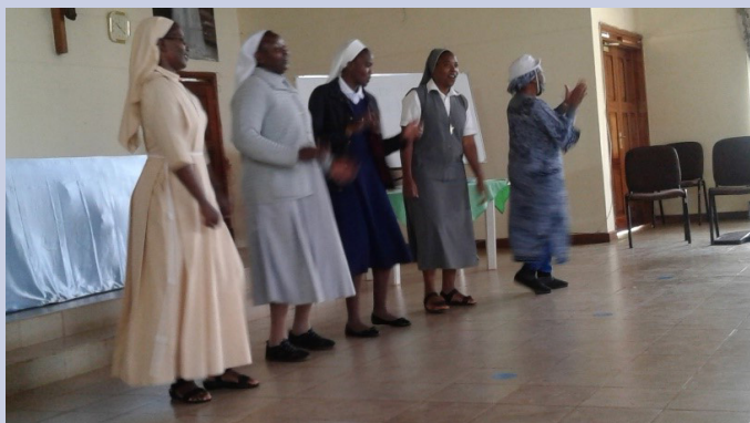
AOSK-Chemchemi ya Uzima Sabbatical Students during the recreation day on 14/04/2022.

day for the whole group that was held on 14th April 2022. This is a day full of fun as every small community prepare various items to entertain one another. As the program is focused towards reawakening the hero within, many feel relaxed and rejuvenated as they discover their potentials. This is done every semester to relax and share the talents with another.