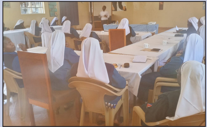
AOSK Insurance agency Meetings with a number of Congregations during the Month of April