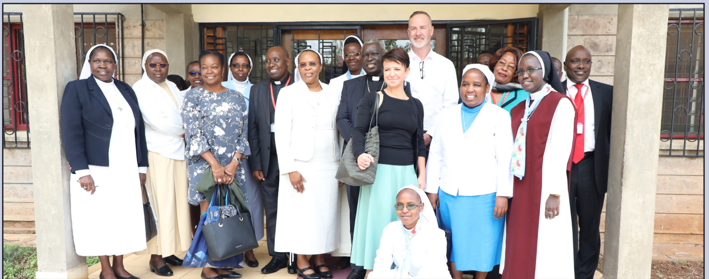
A group photo with the Key Donors from the Conrad Hilton Foundation