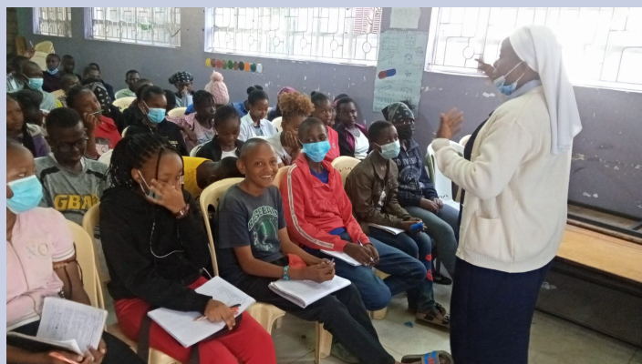
Participants Keenly following up the session during one of the Pax Christi's forum in April 2022.