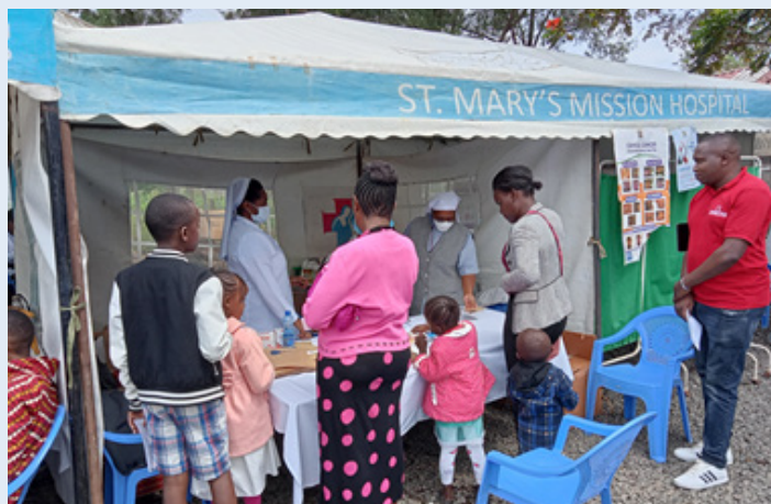
Muthale Mission Hospital and St. Mary's Mission Hospital in Lang'ata carrying out their free Medical Camp