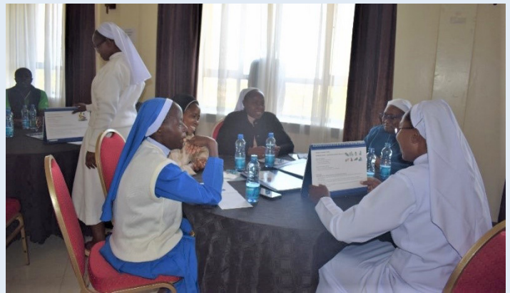
Master trainers practicing group facilitation

During the month of May, SCORE ECD Project conducted two major activities, the activities included, curriculum training for master trainers and the integrated mother baby course (IMBC) training. On the Curriculum training for Master trainers, AOSK and CRS staff conducted a three day activity. This activity was conducted at Pinecone Hotel in Kisumu County. The training oriented and equipped the master trainers with knowledge and skills needed to implement the project to the beneficiaries.