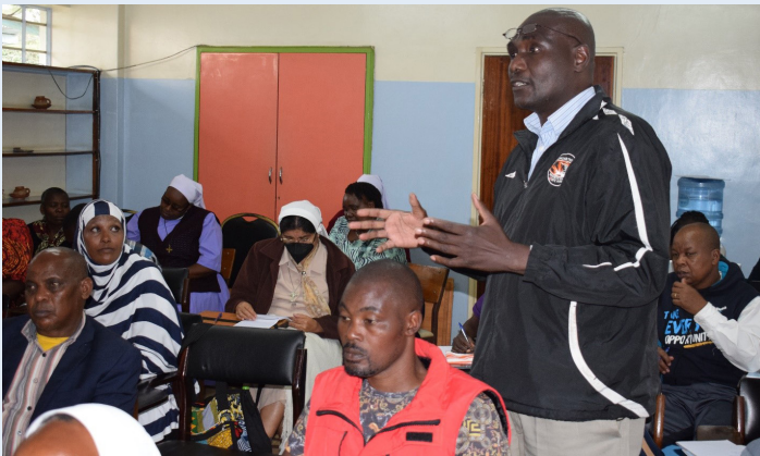
Participants during a refresher training on Civic and Voter Education at Tumaini Centre

On May 6, 2022 the Justice and peace department organized a one-day refresher training for 29 Peace champions drawn from across the seven Nairobi sub counties on Civic and Voter Education, Citizen's rights, Peacebuilding and Conflict Transformation. The Peace champions are expected to cascade this information to their communities' targeting women, men and youth in order to promote citizen participation, tolerance and peaceful co-existence among communities before, during and after elections