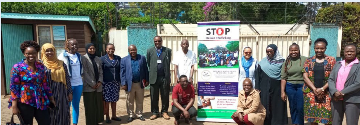
RAHT Partners having a group photo at Tumaini Centre grounds after a Successful discussion on 27th May 2022

The second phase of RAHT program saw eight congregations organize and implement their Human trafficking campaigns. These campaigns were conducted in eight dioceses namely; Mombasa, Nairobi, Ngong, Kakamega, Machakos, Archdiocese of Kisumu, Kitale and Nakuru. The outcome of these campaigns were positive as more people seemed to have a vast knowledge about matters Human trafficking. Elsewhere, on 27th and 28th of May 2022, RAHT conducted two separate activities at AOSK Tumaini centre. The first Activity was a partners meeting with people dealing with human trafficking who came together to discuss different issues amongst them the upcoming world day against human trafficking. On 28th it was a day of member congregation who are the primary organizers and implementers of human trafficking activities at the grassroot level. It was a day of sharing project process and best practices undertaken across the country.