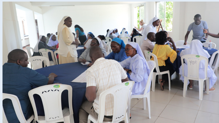
AOSK team Members during their group discussions to discuss the way forward of the organization

As part of organizational learning, The World Café methodology was adopted. The discussion centered around AOSK Strategic themes where this methodology facilitated collaborative dialogue, knowledge sharing and action planning.