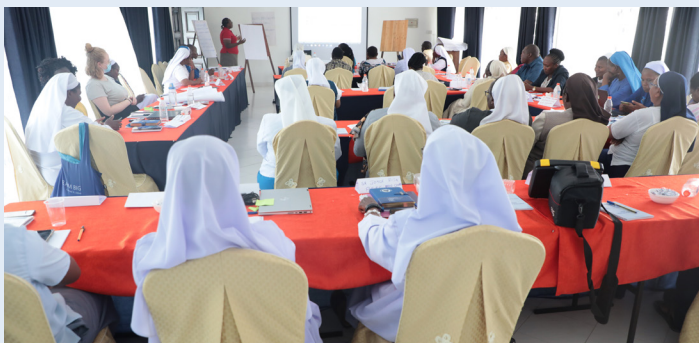
Departments Making their presentations during the Strategic plan 2018-2022 evaluation in Mombasa in May 2022

AOSK has travelled a long way since the adoption of the 2018-2022 strategic plan, which has guided the organization's actions over the period. The year 2022 is a transition period, coming to the end of the 2018-2022 strategic cycle and at the same time defining the next strategic plan 2023-2027. Before starting on a new cycle, it was critical for AOSK to assess its achievements over the period of strategic plan implementation. From 9th-14th May, 2022, the AOSK executive board members together with the AOSK staff travelled to Mombasa for 2018-2022 strategic plan evaluation. This exercise of collectively evaluating our strategic documents is a key action for feeding into our strategic, programmatic and organizational development planning. During the evaluation, AOSK programs and departments presented their evaluation reports highlighting their achievements, challenges and the lessons learnt over the period of implementation.