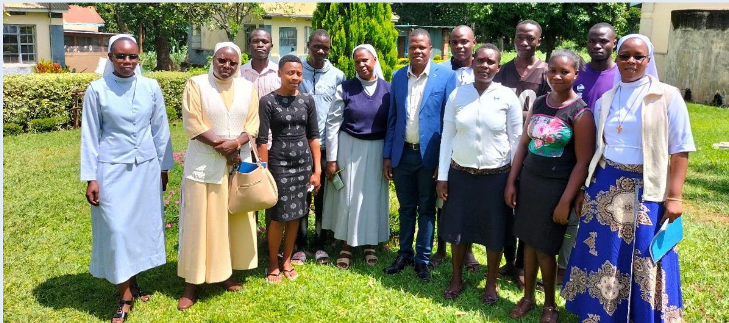
AOSK-SLYI team, AOSK executive secretary and St Jude representatives during the institution visit to deliberate on the Mega business

In May 2022, the AOSK-SLYI had a deliberation meeting with two of the proposed Mega businesses that would be hosted in Siaya and Mumias. These businesses are; St. Anthony spin knit manufactures in Siaya county and the catering business at Saint Jude technical college in Mumias. The deliberation was based on the impact that the businesses would have on the youth's livelihood, the community, and the institutions. Through these businesses more youth from these communities will be employed.