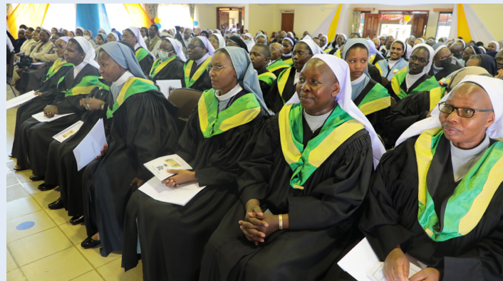
AOSK-Chemchemi ya Uzima Students during their graduation in May 2022