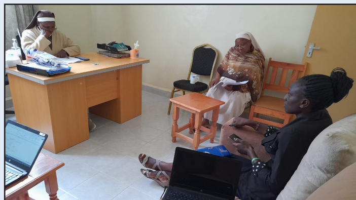
AOSK Insurance Staff Members during their business Meetings with Franciscan Sisters of St. Anna in Kisumu and Daughters of Jesus the good shepherd in Kitui.