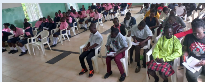
The youth at St Oda school for the virtually impaired attentively following the facilitators' inputs during the psychosocial forum in May 2022.

Also during the Month of May, AOSK-SLYI was able to conduct one psychosocial forum at saint Oda school for the visually impaired in Siaya county, this forum was attended by 67 youth and it aimed at creating awareness on the contemporary issues that affect the youth in the society. Amongst the topics discussed were, drug and substance abuse, Media and cultural impact on the youth and the issues of early marriage amongst the youth. The day was a success and most youth were satisfied with what they had gained.