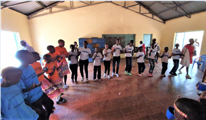
Children Participating in drama and Singing competition in one of the AOSK-CCCK zone

CCCK in the month of April and May facilitated children activities which included games, drama, singing and festivals. This was done at zone levels. Zones that participated included Lodwar, Maralal and Bungoma. In each zone three homes participated where by at the end of the day four hundred and forty five children participated. The best performer institutions were awarded trophies.