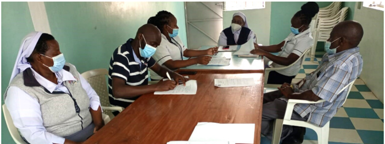
Staff in Our Lady of Lourdes sharing on their successes on covid19 response to the hospital

Elsewhere on the Covid19 response project, a random visit is currently being conducted to 5 health facilities that participated in this project as part of M&E activity. On 28th and 29th of July 2021, AOSK Unit visited Muthale and Our lady of Lourdes Mutomo hospitals. During this visit, the staff and CHV shared on successes of the trainings that were done on Covid-19 pandemic. In Muthale hospital, the healthcare providers felt empowered such that they no longer fear to admit covid19 patients. The CHVs are now connecting those with signs and symptoms to the facility for support.