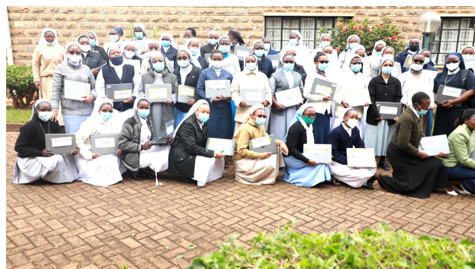
A group photo of SLDI students at Dimesse sisters Centre in Karen.