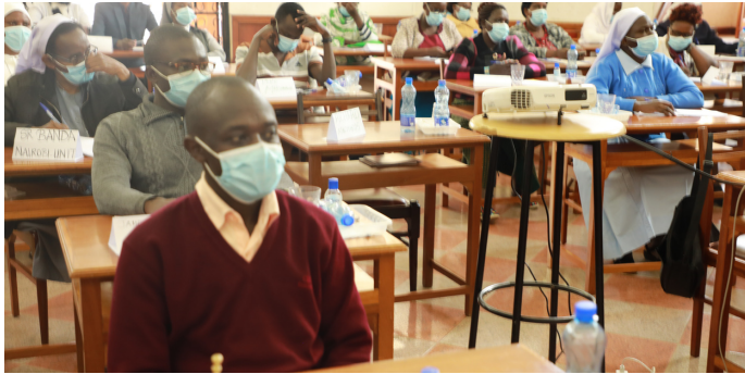
ToT's During a refresher Training at Dimesse sisters centre, Karen.

The refresher training also aimed at strengthening the participants' knowledge, provide an insight and information on Sexual Gender Based Violence (SGBV) and what needs to be done to support victims of SGBV and Human Trafficking.