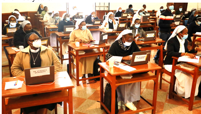
SLDI students following a session during a training at Dimesse Sisters Centre, Karen.

During this year's workshop, 50 sisters were privileged to participate in a one week onsite orientation at Dimesse sisters Center in Karen and thereafter continue with a three month online training. Thereafter, these sisters will join the other 100 sisters who have been going under this kind of program for the past three years meaning that at the end, the program will have 150 students graduating. By the end of the three months, the fifty sisters are expected to be fully equipped on matters finance and basic technology. The ASEC program is funded by Hilton Foundation.