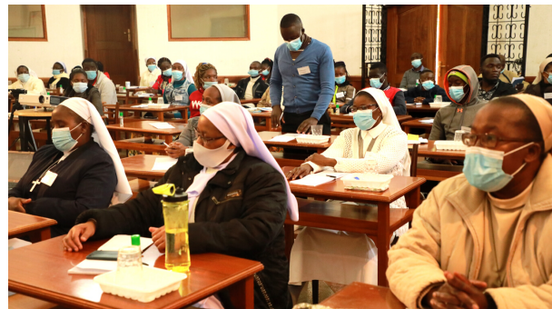
Youth and Sister's administrators during a forum at Dimesse Sisters centre, Karen

The second session organized by AOSK-SLYI took place on 19th-20th July at Dimesse Sisters. In this forum, 38 youth, 19 sister's administrators together with six mentors were present. The main objective of this forum was to introduce youth to the government programs. Through this forum, all present were able to know various opportunities that are available and the criteria used to benefit from such prospects. The representatives who came presented different ministries such as Youth Development Enterprise Fund, Women Enterprise Fund, Education and Youth Affairs. The four representatives were well equipped with information and were able to transfer knowledge to all present.