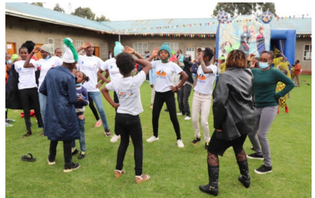
Children from Talitha Kum Home Celebrating their open day with a dance

We thank God for accompanying us on this journey and for all the well-wishers who endeavour to see our children live normal lives just like all other children. In the spirit of the AOSK-CCCK program, we champion for Holistic family and community-based care for children as we share in this noble mission for ‘whoever welcomes a child.’ welcomes me, ‘Says the Lord’. AOSK-CCCK program is funded by GHR foundation.