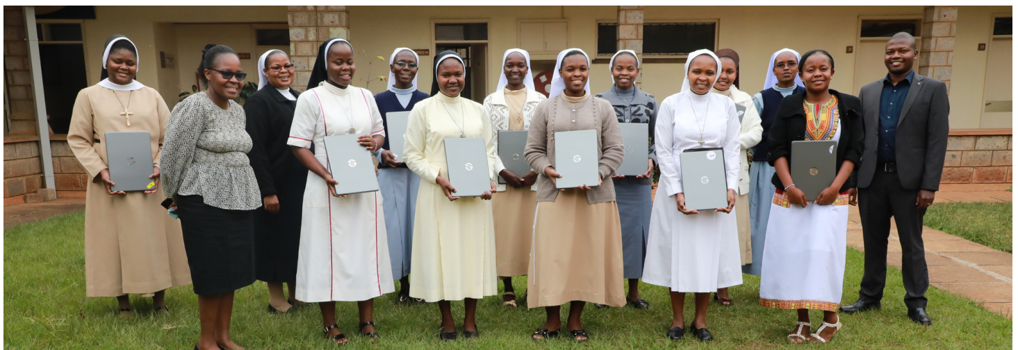
A group Photo of Facilitators together with the 10 ASEC students who will be joining Marywood University.