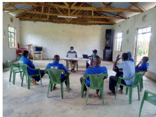
CHVs from Lwak and male champions from Rang'ala during the final evaluation