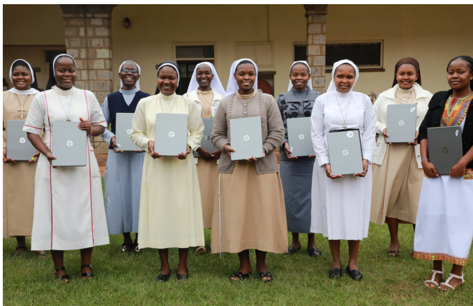
ASEC students with their awarded laptops during the orientation at Dimesse Sisters Center, Karen

This training has a number of benefits amongst them being that; It prepares students for success in their programs, it acclimates sisters to higher education study prior to entry, it sets goals and expectations and Establishes an internal support system among sisters within each cohort and lastly sisters receive their laptops and initial technological training during the Orientation.