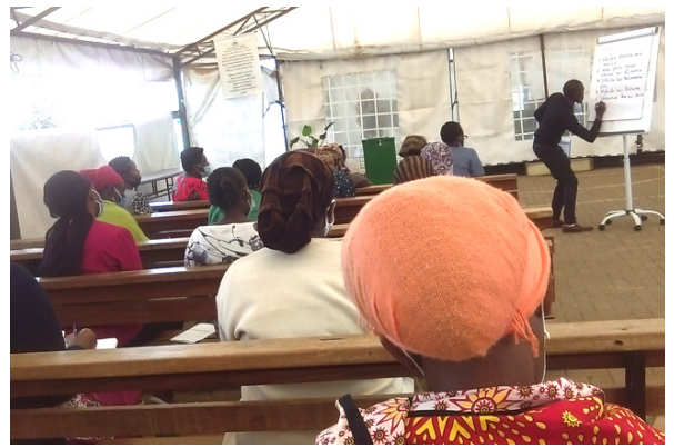
Women undergoing a mentorship forum in Kibera

On the Social Economic Empowerment for women living in Kibera informal settlement AOSK-JPC distributed seed money to 115 and 30 young mothers cumulatively to help them boost their various businesses following the negative effects of Covid 19 pandemic. Through the support the women beneficiaries are slowly restocking their businesses. The women beneficiaries also went through three sessions on group learning on record keeping to help them track their business spending on profit and loss.