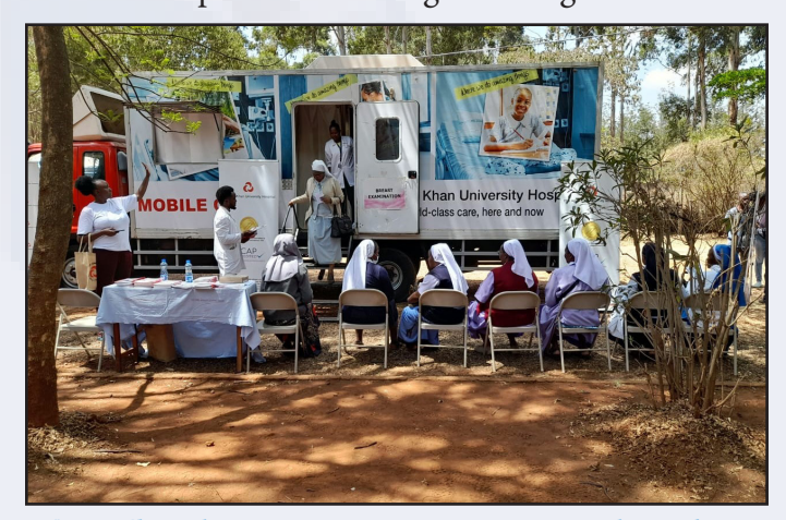
Aga Khan breast cancer awareness truck and sisters waiting for the examination

tal and all of them had tests that included, checking their blood pressure and sugar amongst other tests.