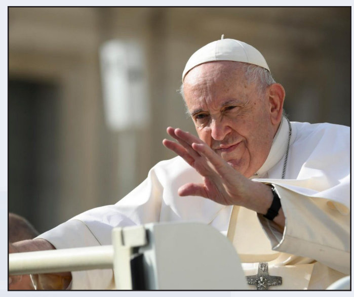
The Holy Father Pope Francis

nied the right to live out their childhood peacefully and joyfully, that they are denied a future of hope'