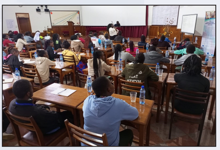
Group Presentation during the Youth reflective meeting at Dimesse Sisters Karen in November 2022

that they could leverage on after graduation including Youth Fund, Women Enterprise Fund, National Government Affirmative Action Fund (NGAAF), KYEOP and UWEZO Fund.