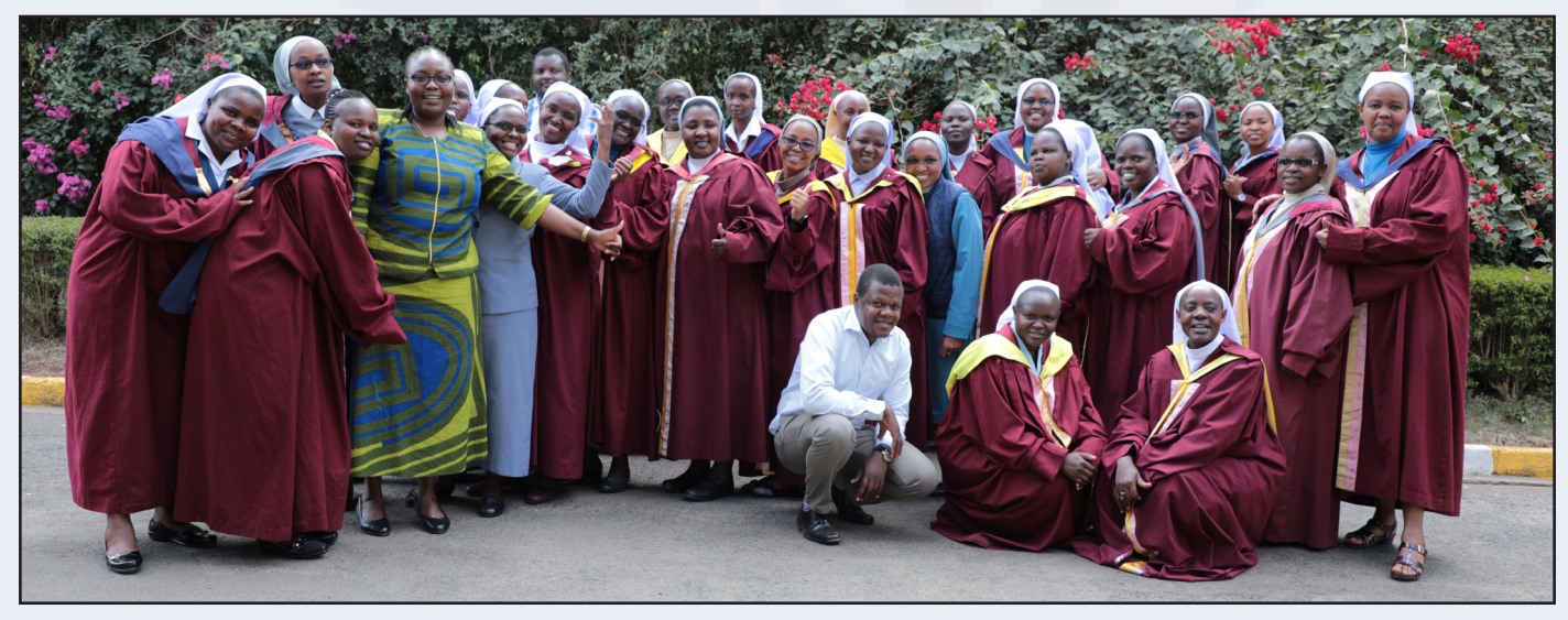
AOSK-CCCK sponsored students during their graduation at the Catholic University of Eastern Africa on 28/10/22.