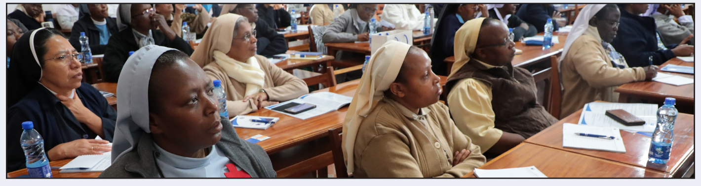
Sisters making a follow up during the AOSK agency presentation at Dimesse Sisters