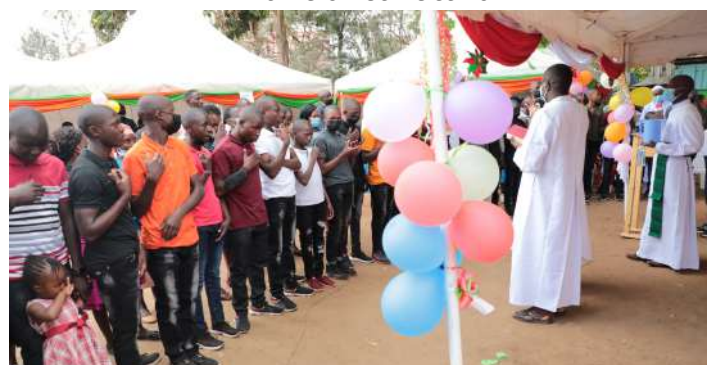
The 34 re-integrated boys from Kwetu Childrens home receiving blessings from the priest