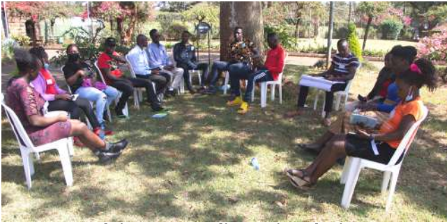
Youth in a group discussion during the AOSK-SLYI AGM.

business ideas, were funded and are implementing them, which have improved their standards of living and reduced their vulnerability. The institutional support has seen an increase in enrollment in all the target sisters led technical training institutions. It is worth noting that the pilot phase of the project reached out to youth living with disabilities. The youth were able to come up with a group business idea just like their peers and were supported with seed capital to start their business. The AGM offered an opportunity for the youth to showcase their products.