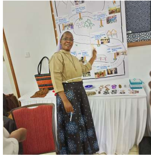
AOSK-JPC presentations during the women empowerment evaluation meeting in Mombasa.