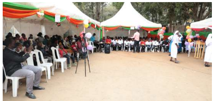
Reintegration Ceremony at Kwetu Childrens home on 8th Oct 2021

Kwetu Home of Peace is one of the Charitable Care Institution (CCI) allied to AOSK-Catholic Care for Children in Kenya (AOSK-CCCK) that rescues, rehabilitates and re-integrates street connected boys back to their families. On 8th October 2021, Kwetu Home of Peace held a thanks-giving mass to celebrate the reintegration of 34 boys whose parents and guardians had come to pick them home after a process of rehabilitation at the Centre. The celebration brought together all the 34 boys who were being re-inserted to their families, the other boys still under rehabilitation, parents, guardians and invited guests.