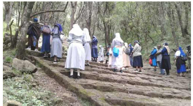
Participants during a Visit to Subukia shrines

On 22nd October 2021, all the participants had a privilege in the company of the program staff to the Marian International Shrine Subukia. This was a very enreaching experience participants expressed their gratitude towards the opportunity granted.