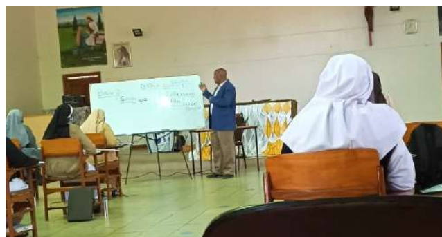
Ongoing formation classes at Chemchemi ya Uzima Institute