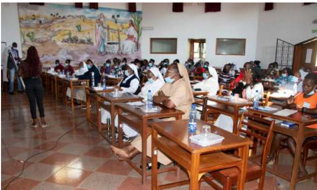
Youth group presentation during the AOSK-SLYI AGM.

The youth highlighted some of the challenges they encounter in implementing their businesses, among which include; limited market for their products, stiff competition, inflation which affects the pricing of their products and limited operation capital. In November 2021, AOSK-SLYI will follow up with the youth businesses, addressing some of the challenges raised by the youth during the AGM.