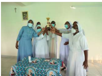
The archdiocese of Mombasa receiving the Prize of being the best AUs.