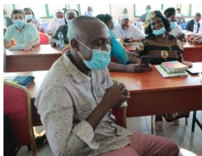
Participants during the AGM meeting at the archdiocese of Mombasa