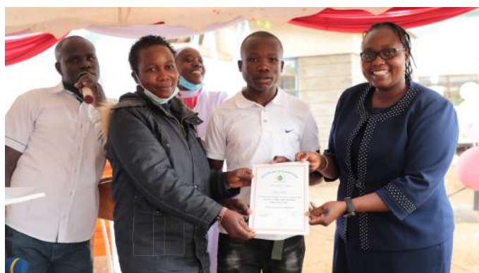
Boys being awarded with certificates of Completion after successfully finishing their period with Kwetu Childrens Home