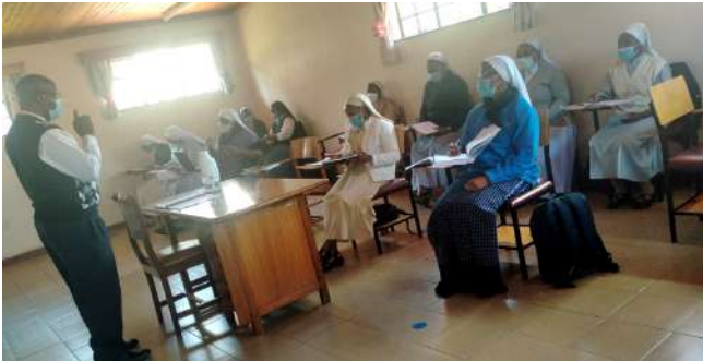
Onsite lectures in Progress

On 18th October, 2021 all ICAPAMI students were happy to resume their onsite lectures, except those in the monastery. Thus blended learning was the only alternative to cater for those who cannot leave the monastery to come to Chemchemi. The quest to learn theology by our sisters in the monastery has widen our horizon to extent our services to them. So now we are offering diploma and certificate in theology online for those who cannot study onsite.