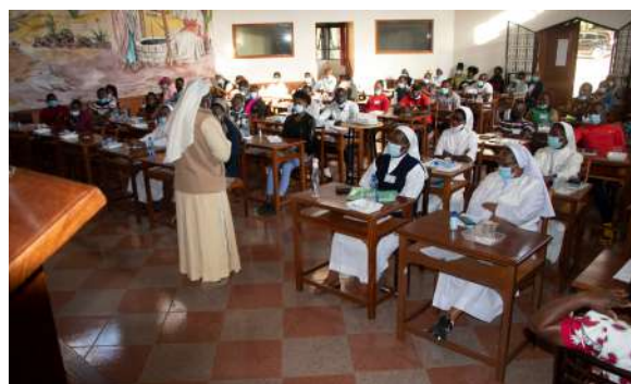
AOSK Executive Secretary addressing participants during the annual reflective meeting.

In mid-October 2021, AOSK-SLYI held a reflective meeting aimed at evaluating the project implementation and its impact to the target beneficiaries as well as deliberating on the way forward. The meeting had an attendance of 75 representatives of all the stakeholders in the project including the 50 youth, 18 administrators 2 mentors and the 5 AOSK program staff. The participants attested to the positive transformation that was evident among the youth in the target communities.