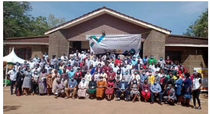
A group photo of the participants during the conference in Siaya County

The 4th blended National ECD Stakeholders conference took place at Jaramogi Oginga Odinga University of Science and Technology from 25th-27th of October 2021. The theme of the conference was; “Responsive Caregiving for Children from Diverse Circumstances: Innovations and inclusivity”. The objectives for the conference included, creating awareness on the need for integration of nurturing care practices in ECD service delivery, advocating for systemic change through policy, at National and County levels, pushing for increased sustainable investments of nurturing care in Kenya and lastly interrogating the social fabric and its impact on child development.