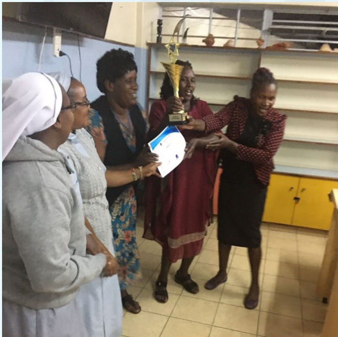
Kericho AU receiving a trophy and certificate after emerging the best AU