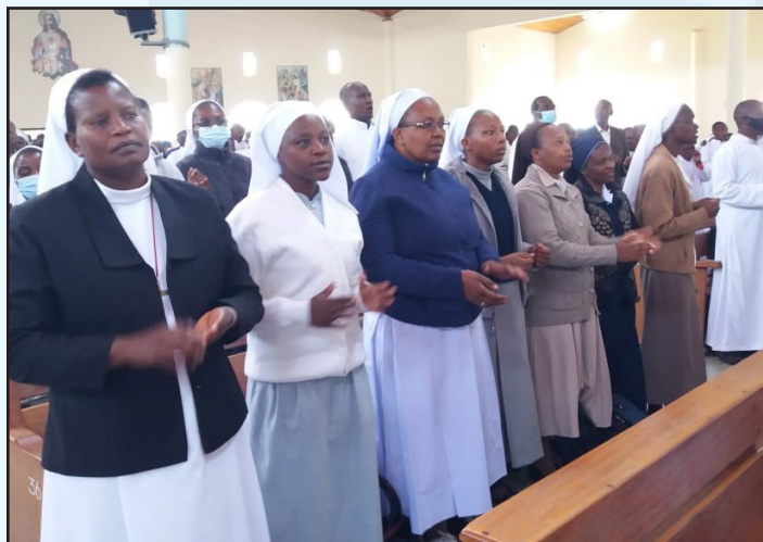
ICAPAMI students during the Eucharistic celebration