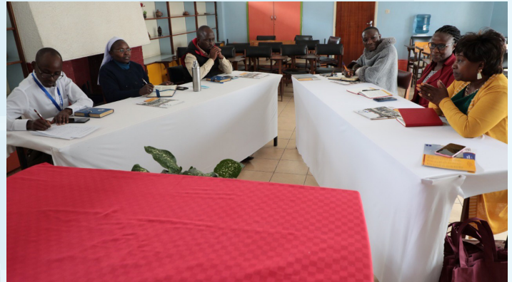
AOSK Insurance agency during their meeting with CIC

the 6th, a meeting was held at St Eugene Marie primary school to discuss on their insurance which has set pace for business growth. The agency is working on finalization of their WIBA, GPA, Medical insurance and insurance for their property. On 15th of September 2022, the agency held a meeting with Pacis Insurance to discuss service issues, debts and business pipeline.