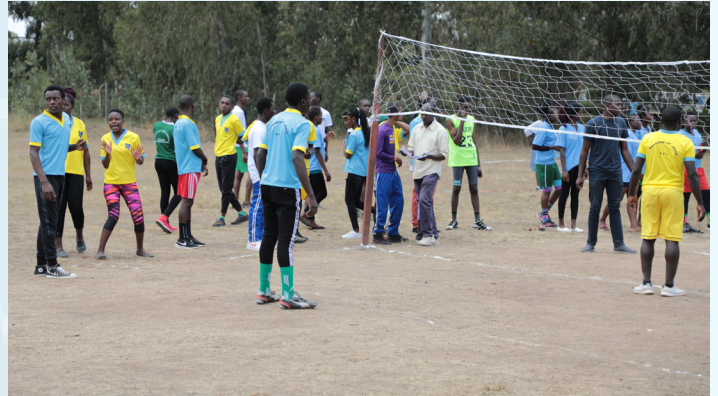
AOSK-SLYI youth during a Joint sports session in September 2022

the documentary for the selected institutions. From these visits the AOSK-SLYI was able to establish that more students have been retained in the technical institutions and are having positive progress in achieving their desired skills for self-sustainability.