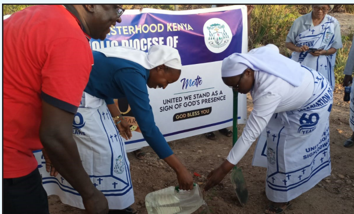
Lodwar AU Leaders planting a tree on the day of AOSK Diamond Jubilee Celebration alongside the Pastoral Coordinator.