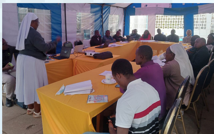
RAHT Member congregation during their Meeting at AOSK Tumaini Centre.