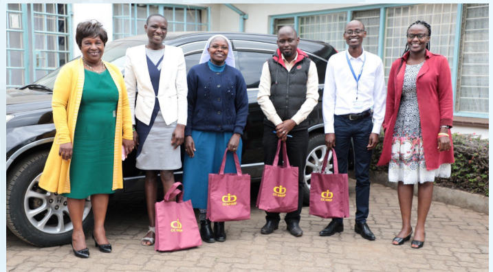
AOSK Insurance agency posing for a photo with CIC members after successfully finishing their meeting