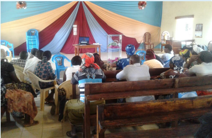
RAHT program during a sensitization forum about Human trafficking in Lamu.

organized for a farm tour at their 3000 Friends Farm in Rimpa Kiserian – Kajiado County. The event attracted about 100 participants drawn from Kibera, Kasarani and the locals. In attendance also were visiting Yarumal priests from Ivory Coast and seminarians from different communities they have in Kenya. RAHT-Kenya was invited to create awareness on matters human trafficking on this population. The participants appreciated the effort being put into this topic as it helps the community remain alert, vigilant and aware of tricks and methods used by traffickers to lure individuals into the process.