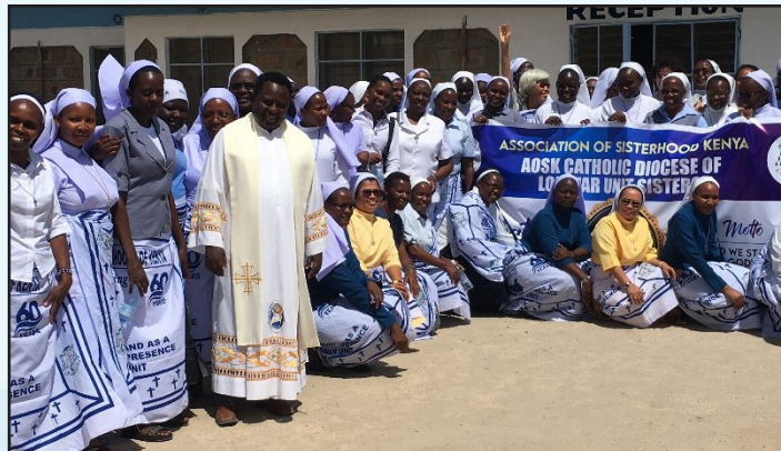
Sisters posing for a group photo after the Eucharistic Celebration with the Bishop and Pastoral Coordinator.